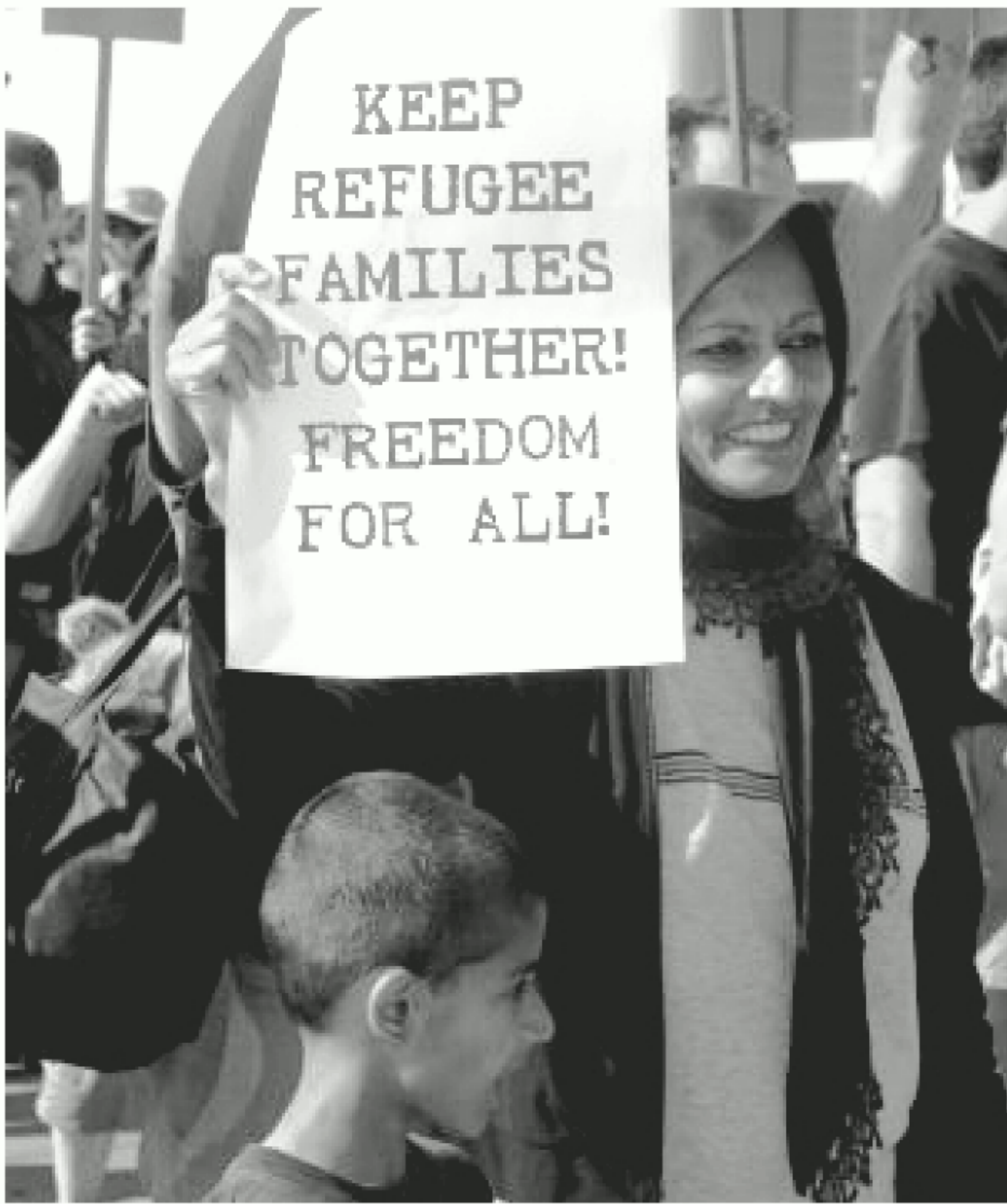
Vancouver residents took part in a national day of action in support of Tamil refugees.

Flooding in Pakistan in the months of July and August killed more than 1,600 people. The flooding is affecting over 13 million people; many are homeless and in danger of dying due to lack of medical supplies, food and water. The Pakistan Trade Union Defence Committee says, "Many put the blame for the floods on global warming, which is also the by-product of capitalist greed for profit at the expense of the environment. That may be true. But what is most certainly true is that the two main factors for this unmitigated disaster were the inadequate and fragile infrastructure and drastic deforestation. Both these are equally the result of the greed of the capitalists and landlords for profit and the unbridled play of market forces."